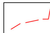
Farm Trail Suggested Route